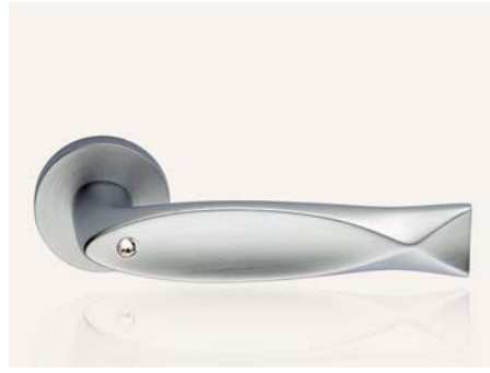
CS cromo satinato satin chrome