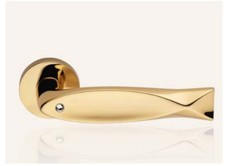
OZ oro zecchino gold plated