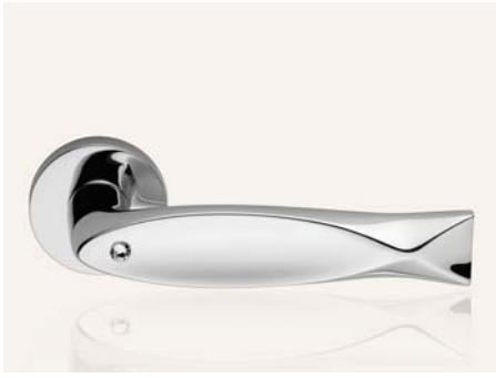
CR cromo lucido polished chrome