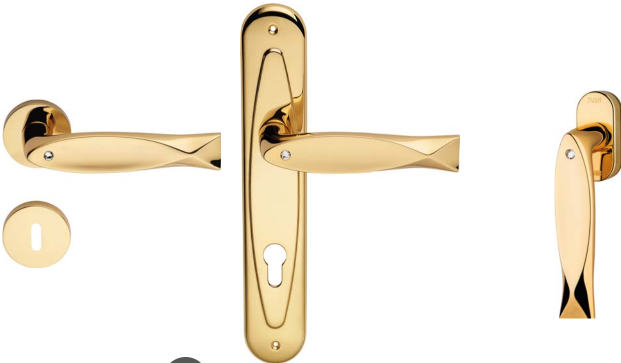
COD. 700 RB 023